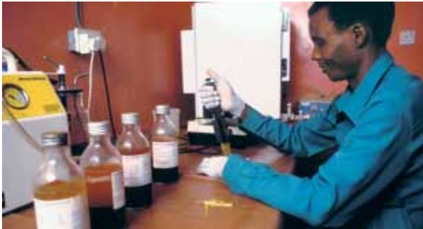
At work in a Tanzanian laboratory

Most African health professionals have few opportunities to refresh or upgrade their training. This affects both morale and the service provided as well as being a contributory factor to 'brain drain'. In an attempt to combat these problems the Foundation's Commonwealth programme has been supporting the development of Southern and Eastern African researchers and practitioners, particularly in Tanzania.